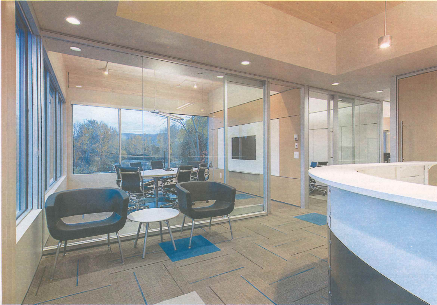
Faction Projects' office building makes full use of its natural creekside setting