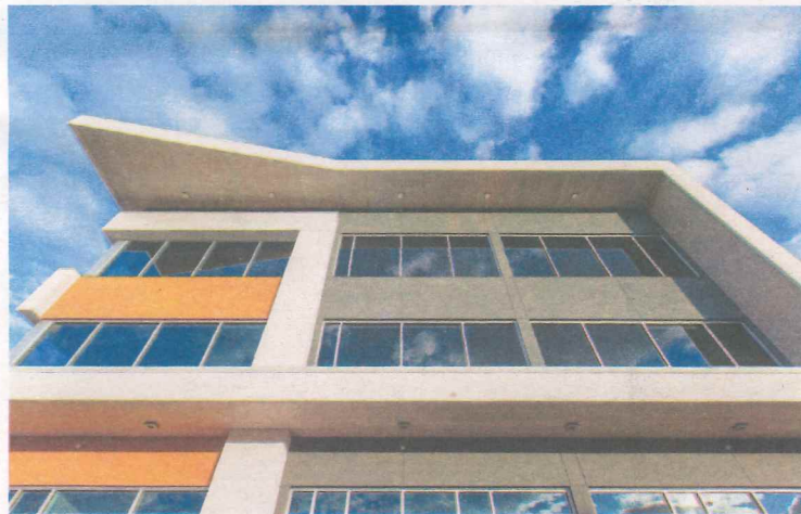
The office building at 3935 Lakeshore Road used CLT in construction for strength and beauty